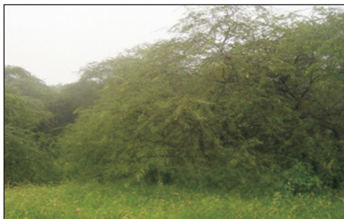
Figure 2. The ridge forest which is dominated by P. juliflora .